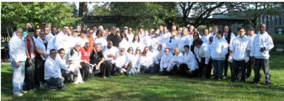
75 staff members from the Intercontinental Hotel and SOAR members gather for the clean sweep of Jane Addams Park.

Over 50 large bags were filled with the collected trash that were picked up the following day by Streets and Sanitation. After completing the cleanup the volunteer "crew" members enjoyed hot pizza generously donated and served by one of our neighborhood restaurants, Pompei Pizza. This was truly an example of the continuing collaboration of SOAR and Streeterville businesses to improve life in our community.