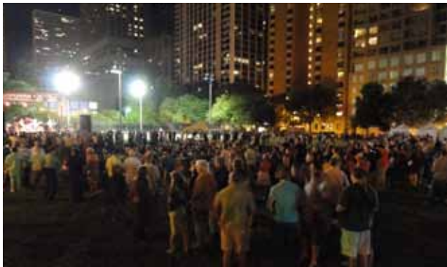
A variety of musical acts kept the crowds rockin' day and night