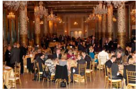
The beautiful Gold Coast Room at the Drake Hotel provided an elegant space for the Blueprints Gala.