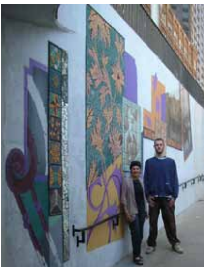
Artists who constructed the murals for the Ohio Street Pedway stand proudly in front of their work.

Artists from the Chicago Public Art Group (CPAG) spent weeks installing a combination of ceramic tiles and paintings to decorate the walls of the ramp and stairs at the west end of the pedestrian underpass at Ohio Street and Lake Shore Drive. This is a welcome improvement to this corner of Streeterville. It will provide a colorful and friendly entrance to the pedway that is used by tens of thousands of residents and tourists each year who visit Navy Pier, Jane Addams Park, Ohio Street Beach and the lakefront.