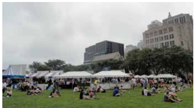
With cloudy skies but no rain, StreeterFest visitors enjoyed hanging out in Lake Shore Park on an August weekend.